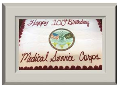
This year's Cake for the MSC 100th Birthday Celebration.