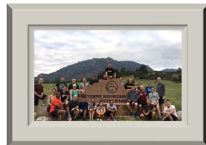
Soldiers from Fort Carson pose for a photo after conducting a run from the Kit Carson Statue to Cheyenne National Park as part of their celebration of the MSC 100th Birthday.