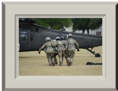
Soldier's assist an Ambulatory patient to a MEDEVAC UH-60M During the MEDEVAC demonstration.