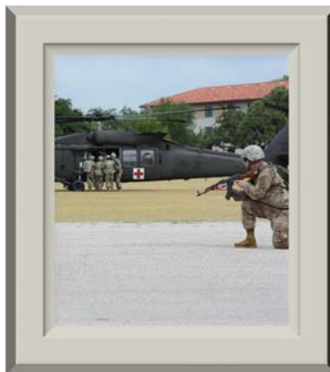
A Soldier pulls guard during the MEDEVAC Demonstration for the MSC 100th Birthday Celebration.