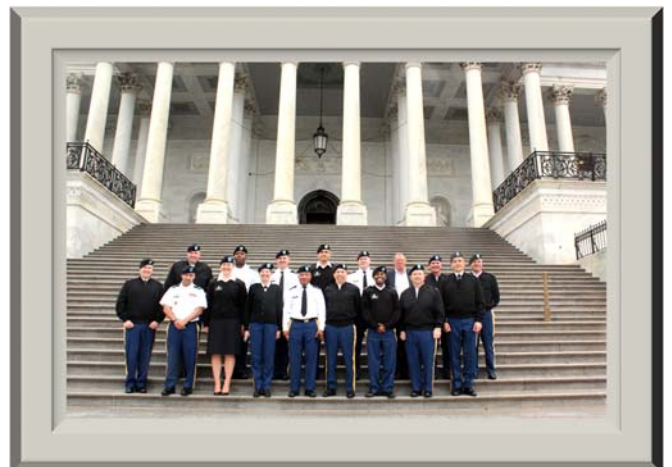
Members of the Fort Detrick Silver Caduceus Society stand on the steps of the Nations Capital Building