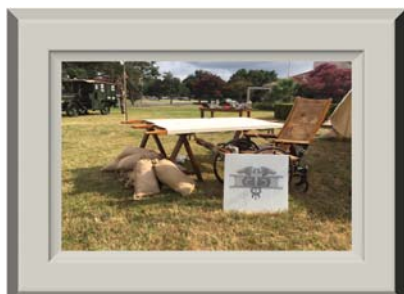
A display of Medical Equipment from WWI is displayed in front of the AMEDD Museum during the MSC 100th Birthday Celebration.